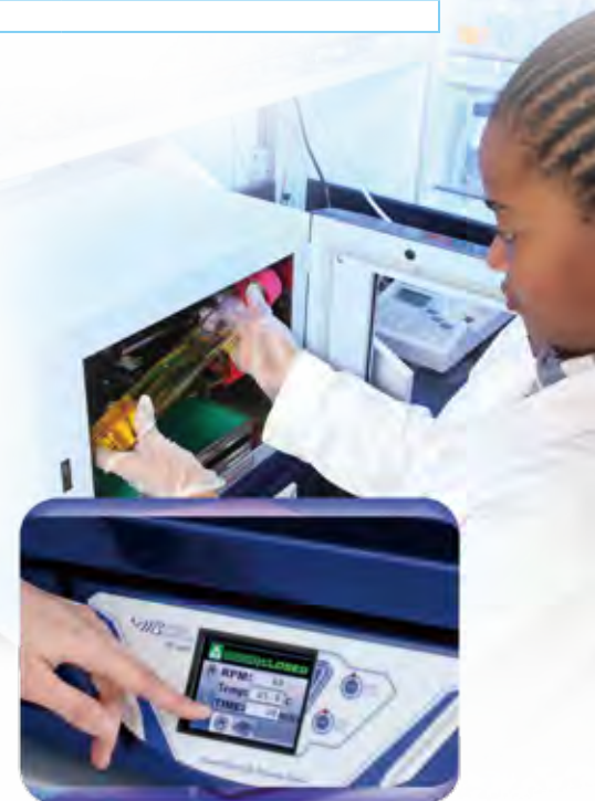
Touch screen & graphical control interface