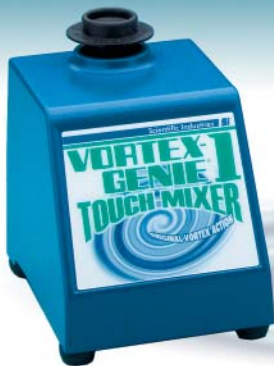
HIGH SPEED MIXER