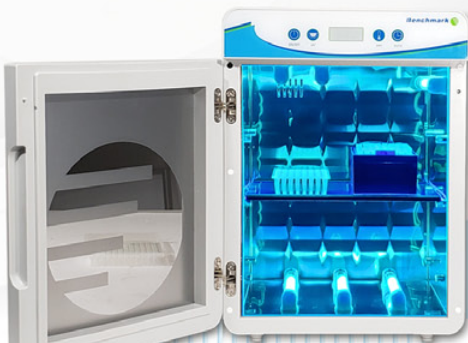
6-bulb design with UV-C transparent shelf for 360° exposure