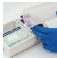
place tray in unit and cover with buffer