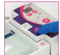
start the run