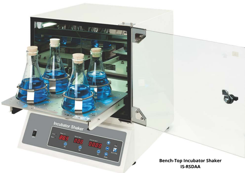
Bench-Top Incubator Shaker IS-RSDAA

Compact Size shaker with advanced features, a sliding platform, and great visibility through a tempered glass door.