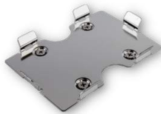
96-Well Microplate Holder