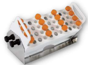
Adjustable Test Tube Rack