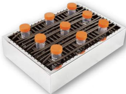
Mini Universal Spring Platform