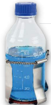
Infusion Bottle Clamp